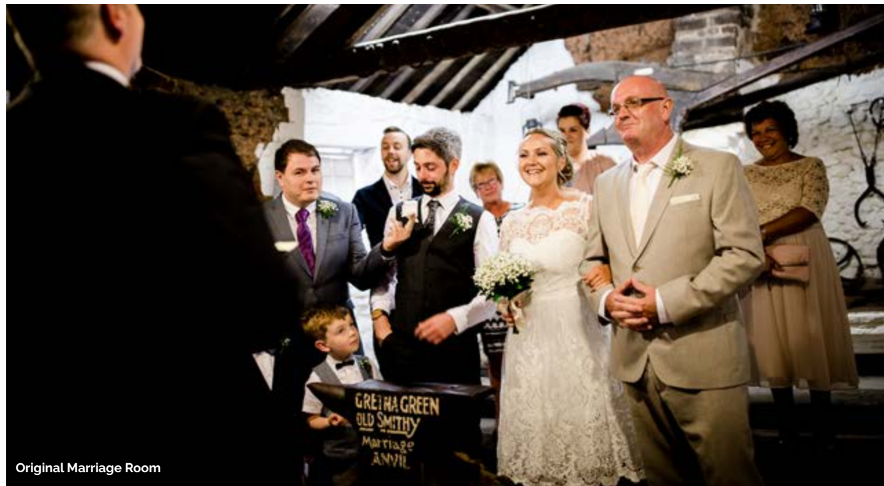
Original Marriage Room

The authentic, original home of the anvil wedding since 1754, the Famous Blacksmiths Shop is world-famous as the runaway wedding destination of choice. Follow in the footsteps of lovers of old and marry over the iconic Blacksmith's anvil.