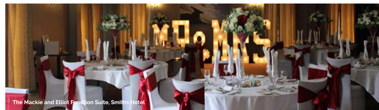
The Mackie and Elliot Function Suite, Smiths Hotel

For more information regarding function room hire or our accommodation, please call our wedding team on: 01461 336 001 or email: weddings@gretnagreen.com or visit: www.gretnagreen.com/weddings