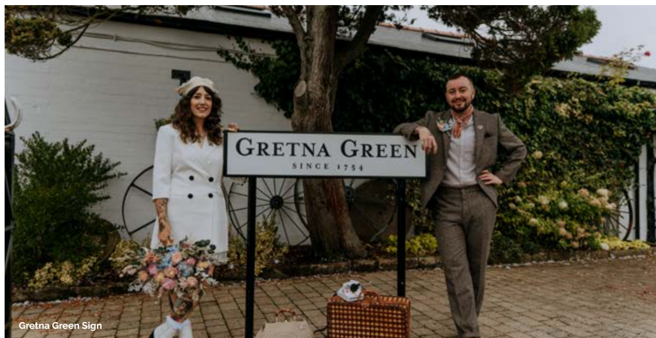
Gretna Green Sign

Additional Guests can be added to all packages. For more information about any of our Gretna Green packages, please call our wedding team on: 01461 336 001 or email: weddings@gretnagreen.com or visit: www.gretnagreen.com/weddings