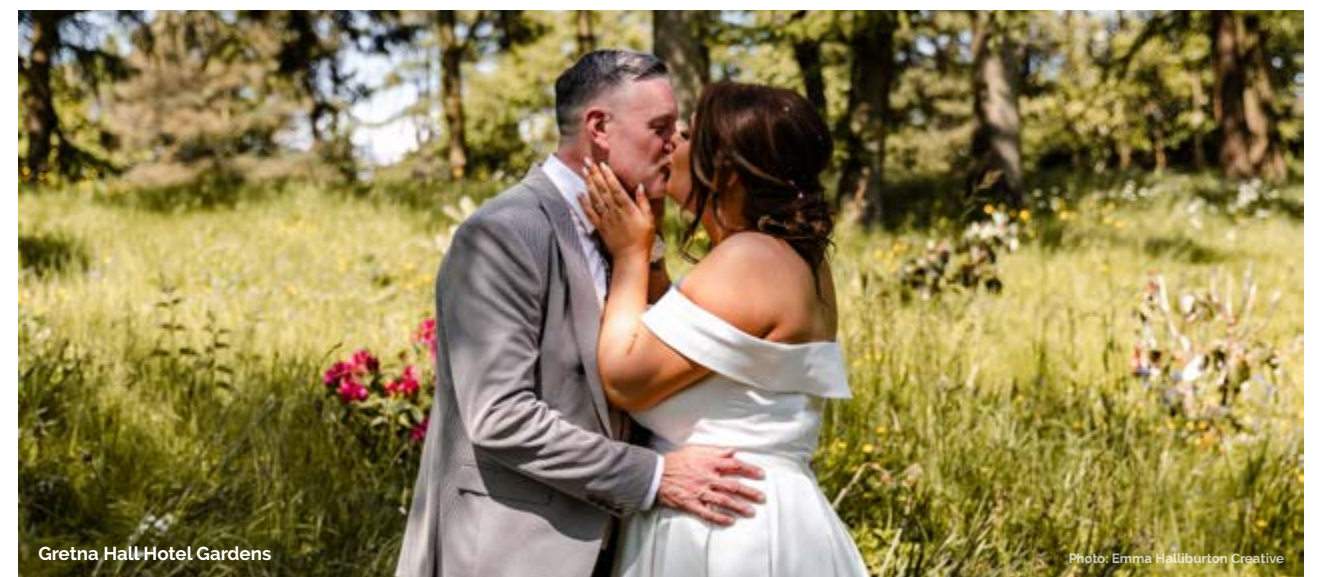
Gretna Hall Hotel Gardens

Additional Guests can be added to all packages. For more information about any of our Gretna Green packages, please call our wedding team on: 01461 336 001 or email: weddings@gretnagreen.com or visit: www.gretnagreen.com/weddings