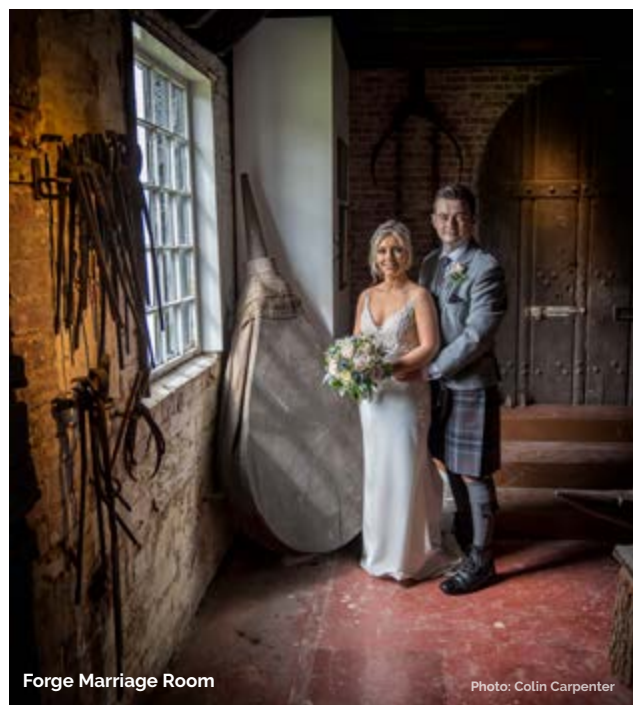
Forge Marriage Room