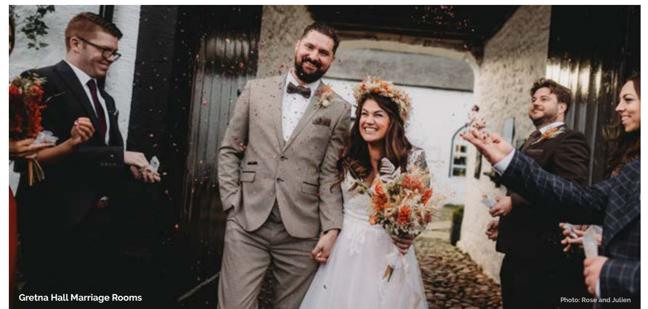
Gretna Hall Marriage Rooms

Additional Guests can be added to all packages. For more information about any of our Gretna Green packages, please call our wedding team on: 01461 336 001 or email: weddings@gretnagreen.com or visit: www.gretnagreen.com/weddings