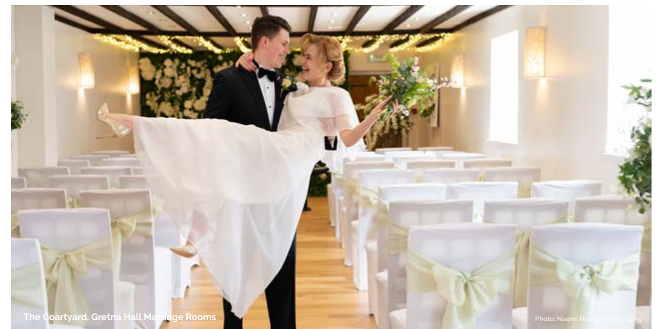
The Coartyard, Gretna Hall Marriage Rooms

Additional Guests can be added to all packages. For more information about any of our Gretna Green packages, please call our wedding team on: 01461 336 001 or email: weddings@gretnagreen.com or visit: www.gretnagreen.com/weddings