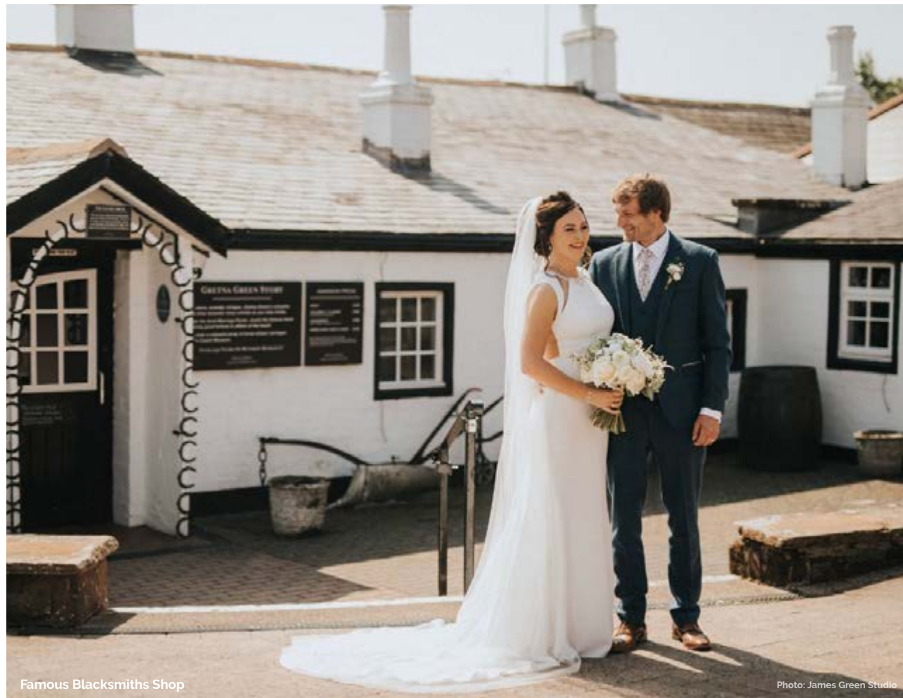
Famous Blacksmiths Shop

Additional Guests can be added to all packages. For more information about any of our Gretna Green packages, please call our wedding team on: 01461 336 001 or email: weddings@gretnagreen.com or visit: www.gretnagreen.com/weddings