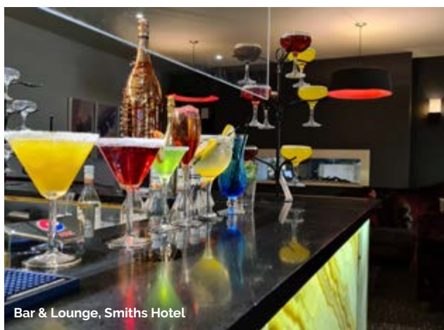
Bar & Lounge, Smiths Hotel