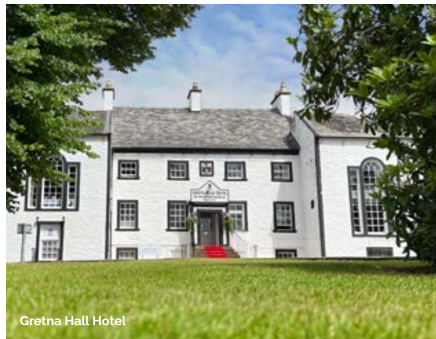
Gretna Hall Hotel

It is the perfect place for your ceremony and reception together for the entire day.