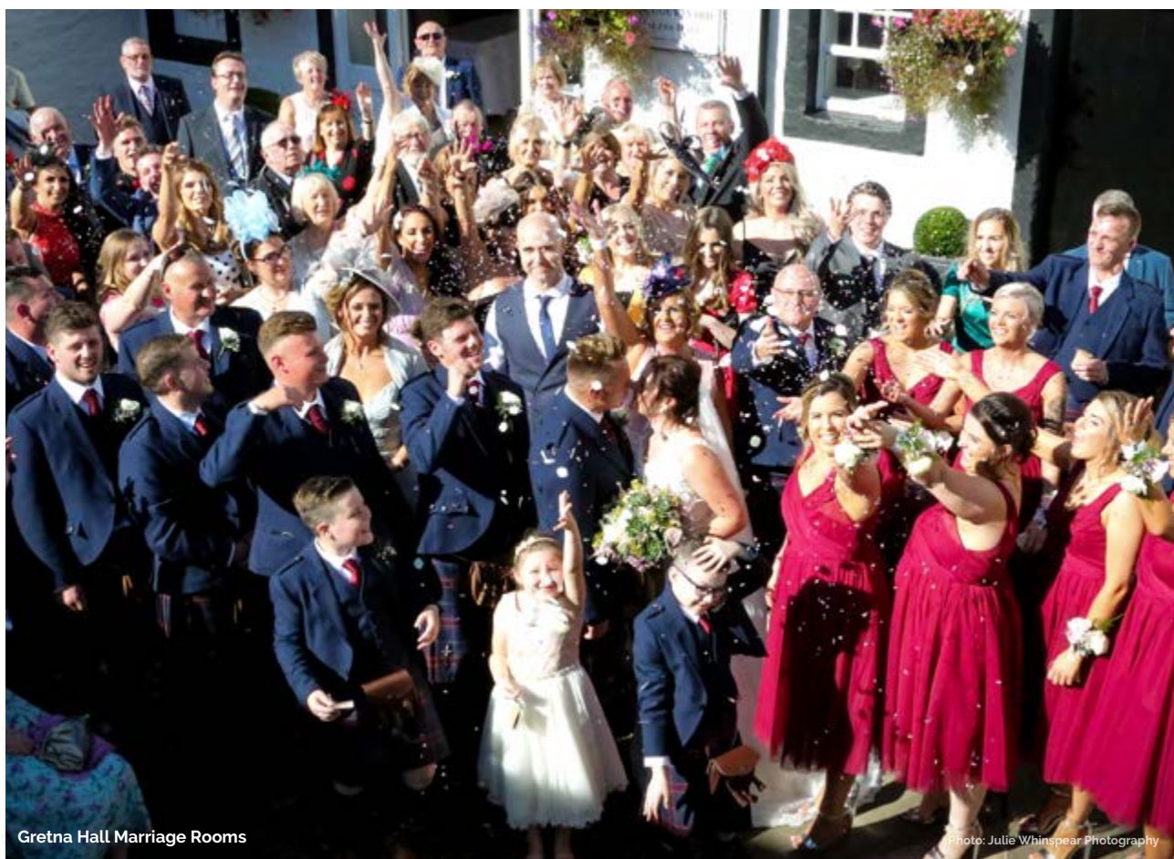
Gretna Hall Marriage Rooms