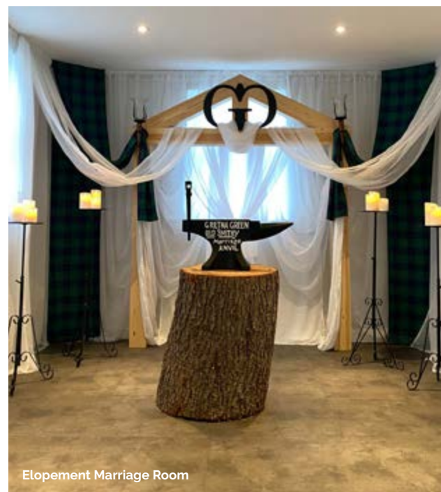
Elopement Marriage Room