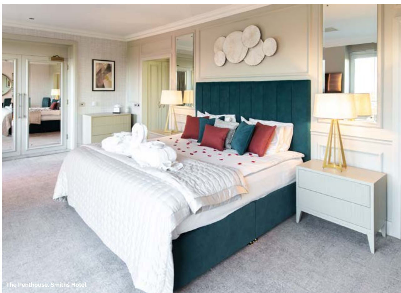
The Penthouse, Smiths Hotel