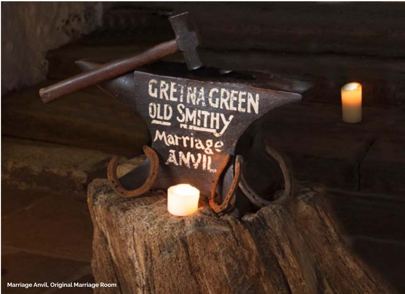
Marriage Anvil, Original Marriage Room

The only place where you can have 'Gretna Green' on your marriage certificate.