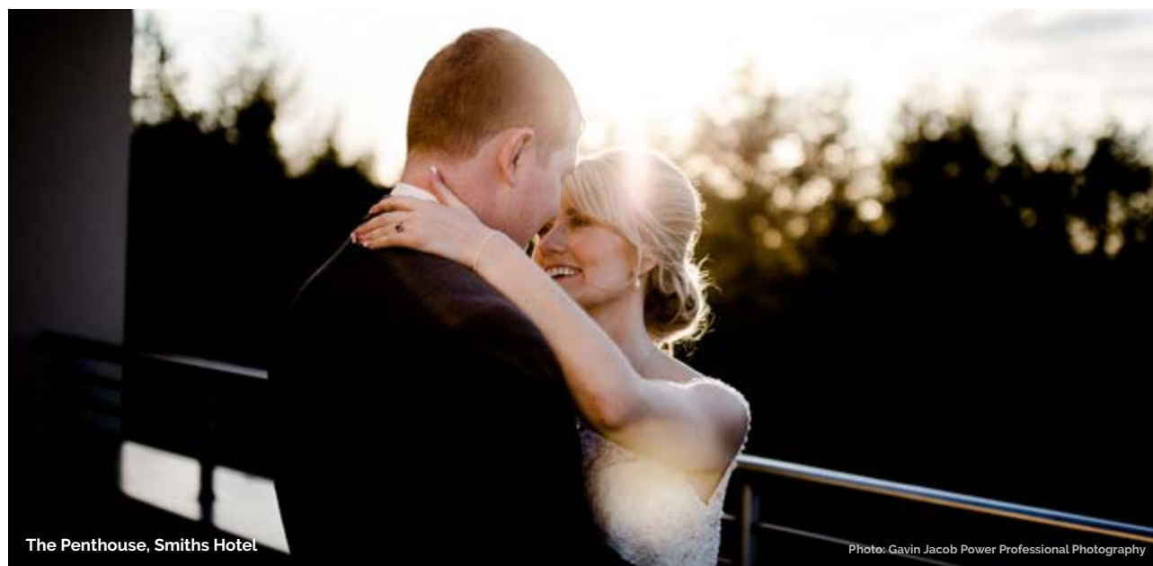
The Penthouse, Smiths Hotel

Additional Guests can be added to all packages. For more information about any of our Gretna Green packages, please call our wedding team on: 01461 336 001 or email: weddings@gretnagreen.com or visit: www.gretnagreen.com/weddings