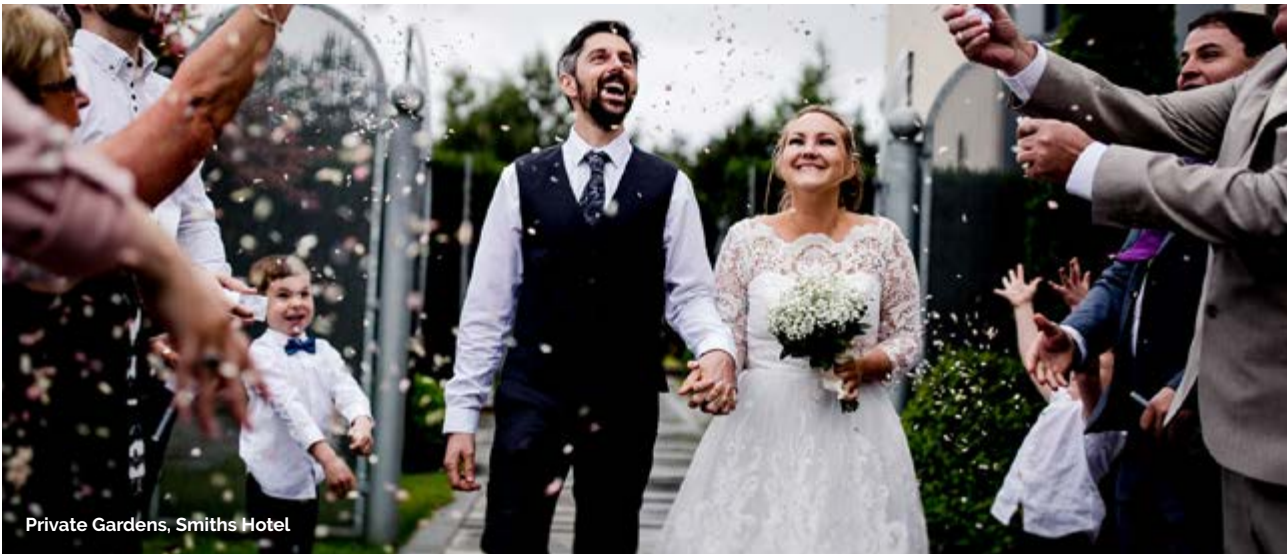
Private Gardens, Smiths Hotel

Additional Guests can be added to all packages. For more information about any of our Gretna Green packages, please call our wedding team on: 01461 336 001 or email: weddings@gretnagreen.com or visit: www.gretnagreen.com/weddings