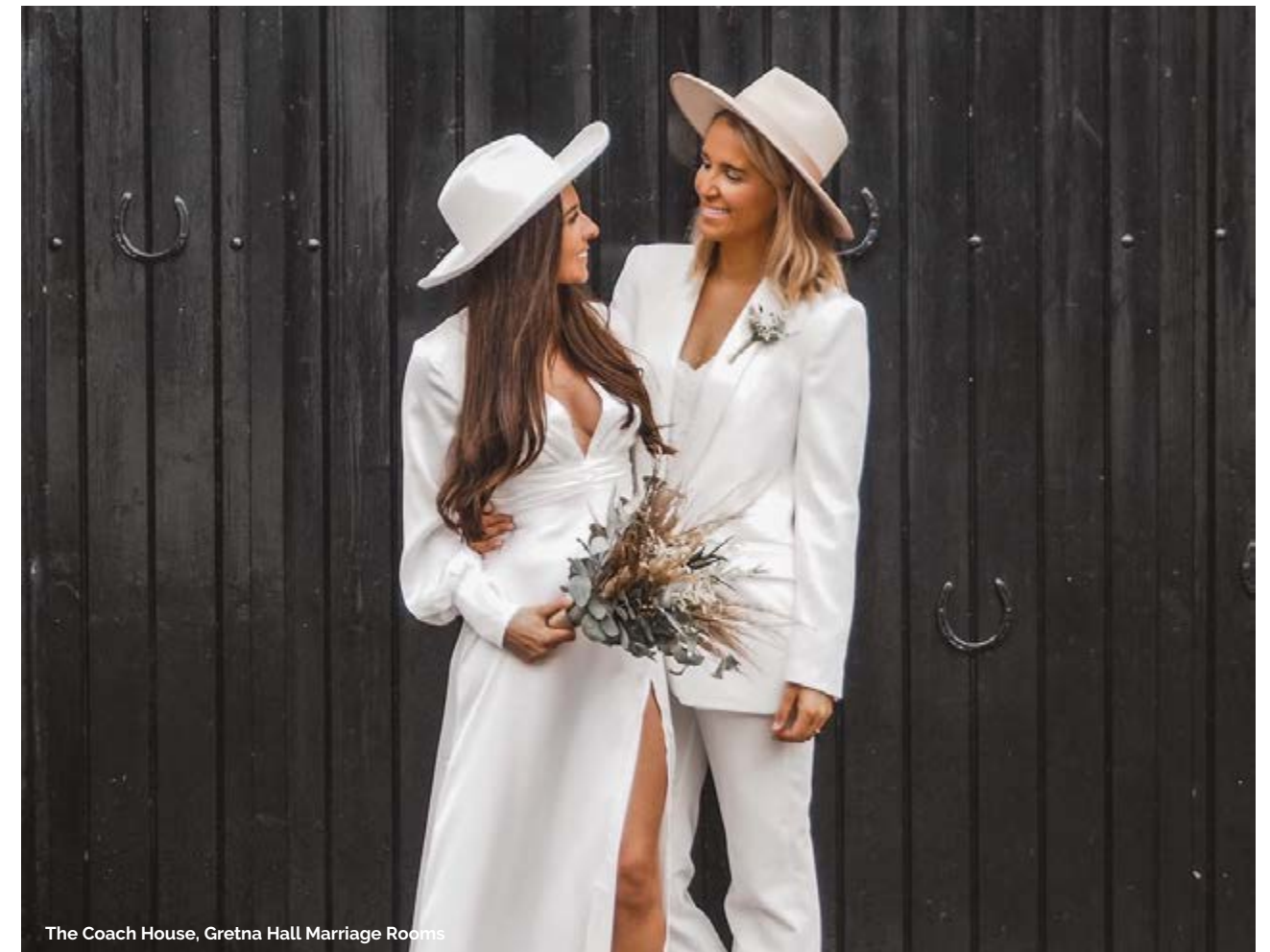
The Coach House, Gretna Hall Marriage Rooms

Additional Guests can be added to all packages. For more information about any of our Gretna Green packages, please call our wedding team on: 01461 336 001 or email: weddings@gretnagreen.com or visit: www.gretnagreen.com/weddings