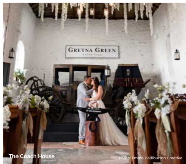
The Coach House