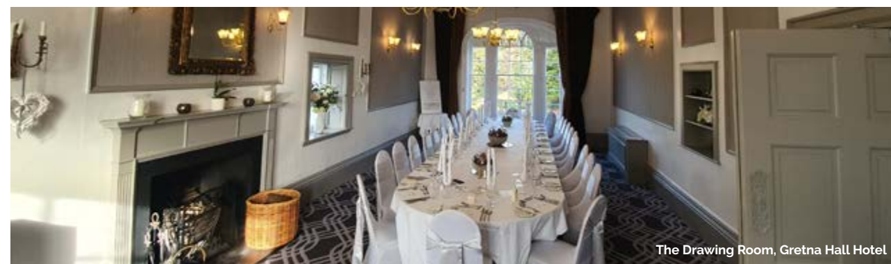
The Drawing Room, Gretna Hall Hotel

For more information regarding function room hire or our accommodation, please call our wedding team on: 01461 336 001 or email: weddings@gretnagreen.com or visit: www.gretnagreen.com/weddings