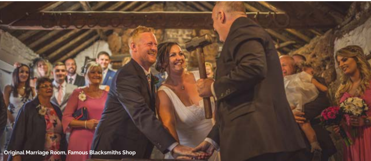
Original Marriage Room, Famous Blacksmiths Shop

Additional Guests can be added to all packages. For more information about any of our Gretna Green packages, please call our wedding team on: 01461 336 001 or email: weddings@gretnagreen.com or visit: www.gretnagreen.com/weddings